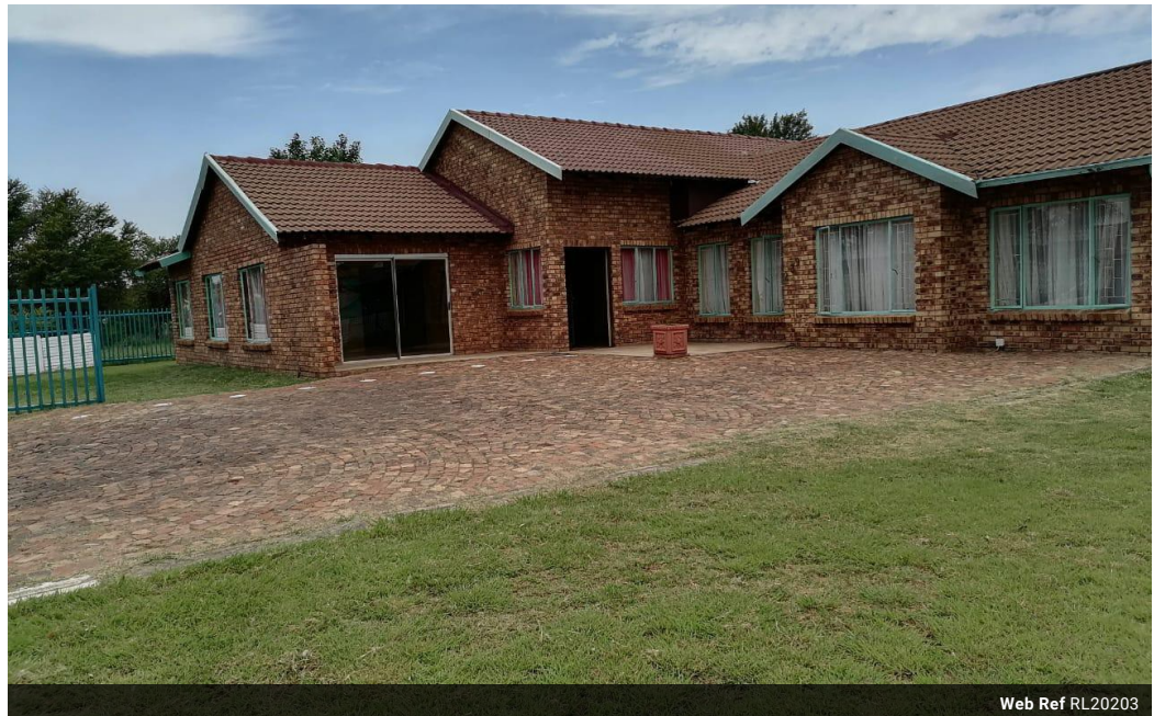
Web Ref RL20203

Third Floor Office Block F Hertford Office Park 90 Bekker Rd Vorna Valley Midrand