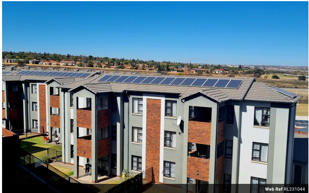
Web Ref RL231044

Third Floor Office Block F Hertford Office Park 90 Bekker Rd Vorna Valley Midrand