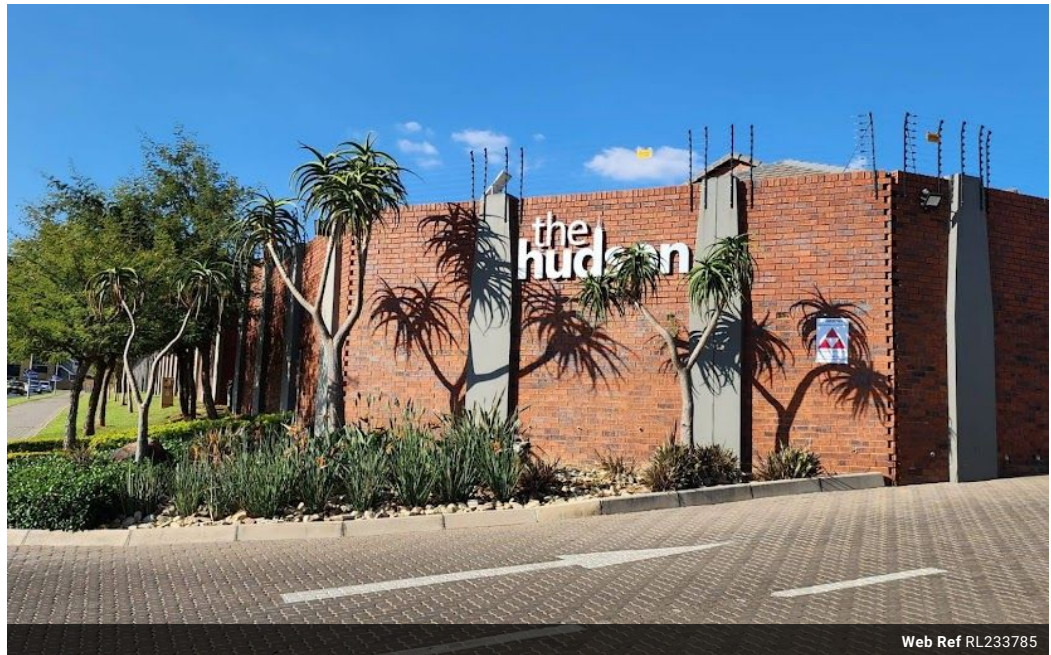
Web Ref RL233785

Third Floor Office Block F Hertford Office Park 90 Bekker Rd Vorna Valley Midrand