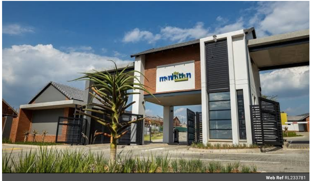
Web Ref RL233781

Third Floor Office Block F Hertford Office Park 90 Bekker Rd Vorna Valley Midrand