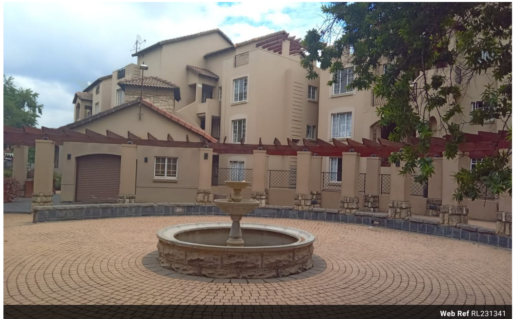
Web Ref RL231341

Third Floor Office Block F Hertford Office Park 90 Bekker Rd Vorna Valley Midrand