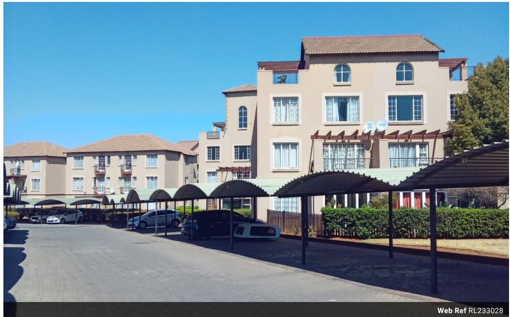
Web Ref RL233028

Third Floor Office Block F Hertford Office Park 90 Bekker Rd Vorna Valley Midrand