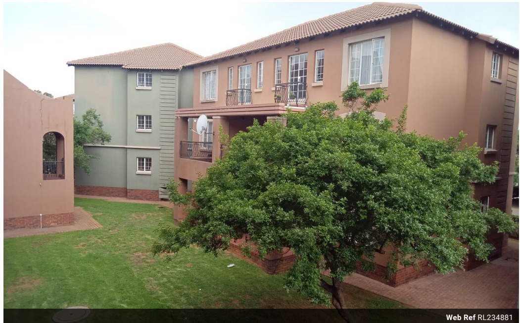
Web Ref RL234881

Third Floor Office Block F Hertford Office Park 90 Bekker Rd Vorna Valley Midrand