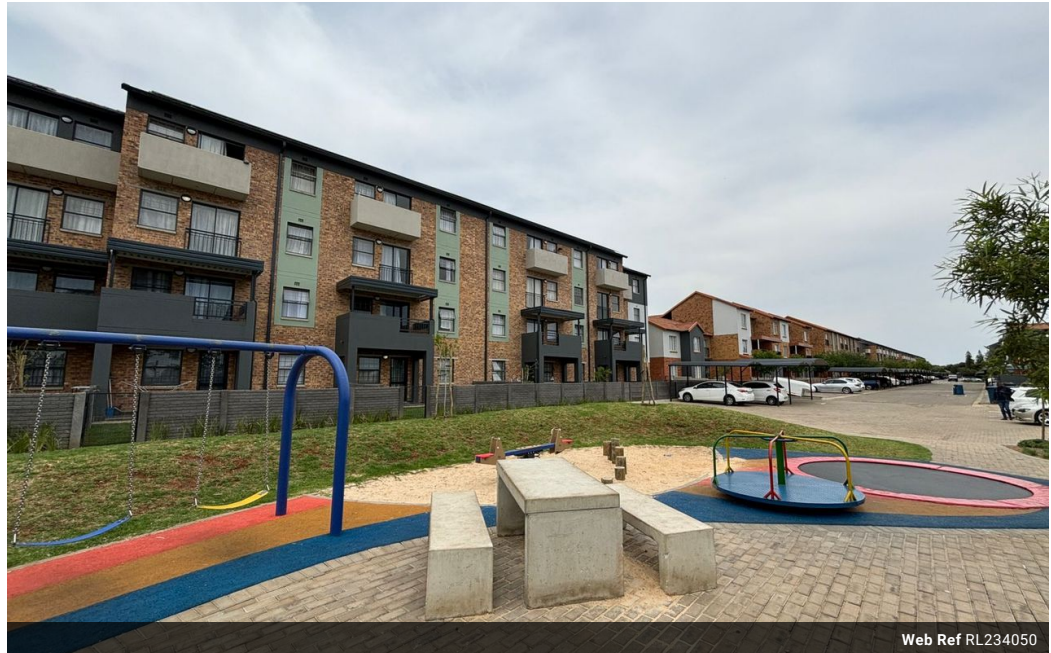
Web Ref RL234050

Third Floor Office Block F Hertford Office Park 90 Bekker Rd Vorna Valley Midrand