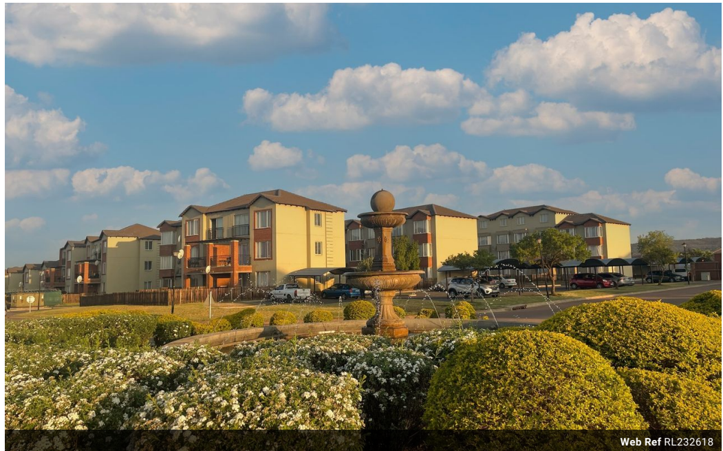
Web Ref RL232618

Third Floor Office Block F Hertford Office Park 90 Bekker Rd Vorna Valley Midrand