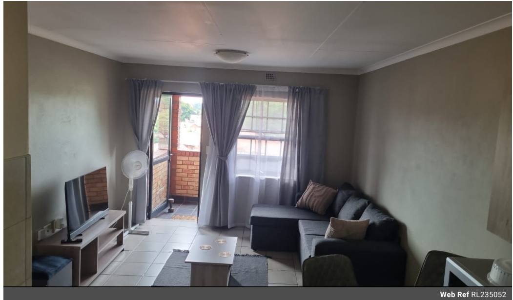
Web Ref RL235052

Third Floor Office Block F Hertford Office Park 90 Bekker Rd Vorna Valley Midrand