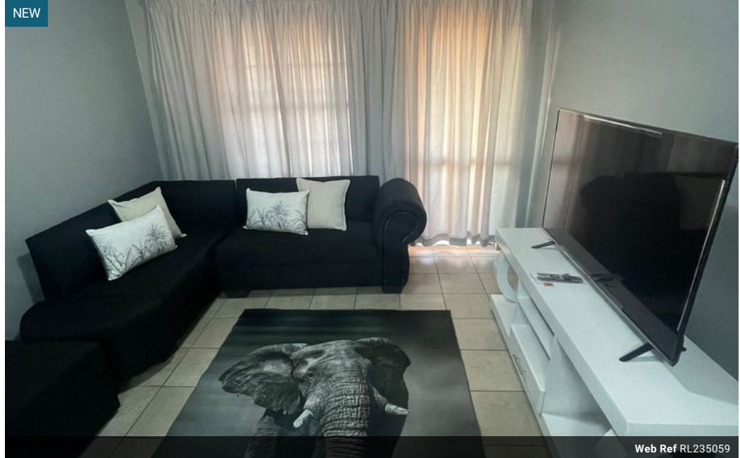
Web Ref RL235059

Third Floor Office Block F Hertford Office Park 90 Bekker Rd Vorna Valley Midrand