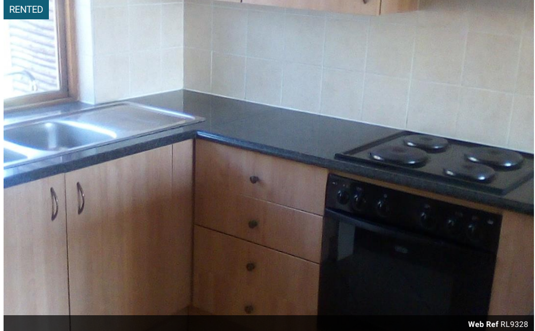
Web Ref RL9328

Third Floor Office Block F Hertford Office Park 90 Bekker Rd Vorna Valley Midrand