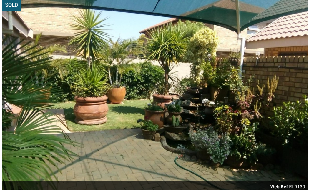
Web Ref RL9130

Third Floor Office Block F Hertford Office Park 90 Bekker Rd Vorna Valley Midrand