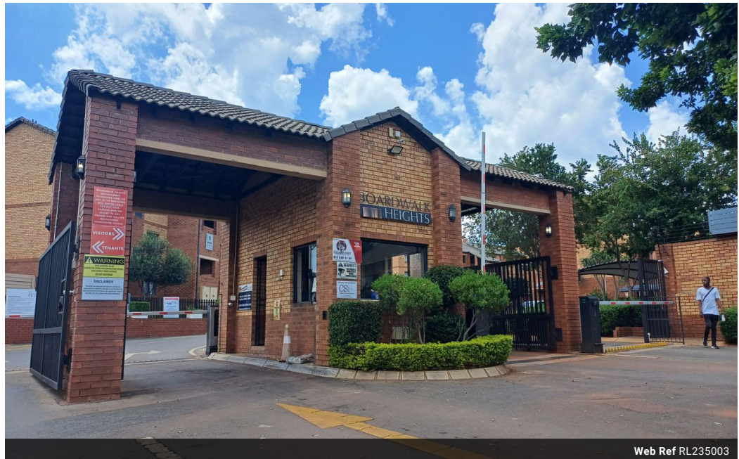
Web Ref RL235003

Third Floor Office Block F Hertford Office Park 90 Bekker Rd Vorna Valley Midrand