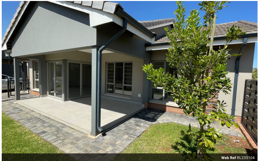
Web Ref RL235104