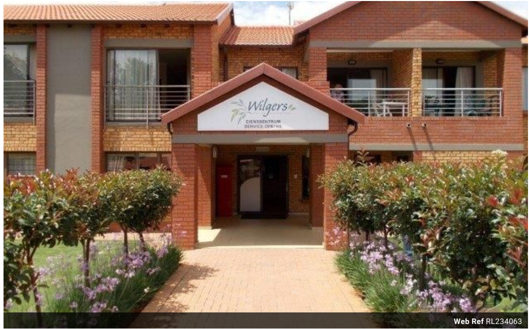
Web Ref RL234063

Third Floor Office Block F Hertford Office Park 90 Bekker Rd Vorna Valley Midrand