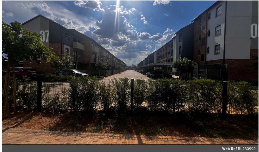
Web Ref RL233999

Third Floor Office Block F Hertford Office Park 90 Bekker Rd Vorna Valley Midrand