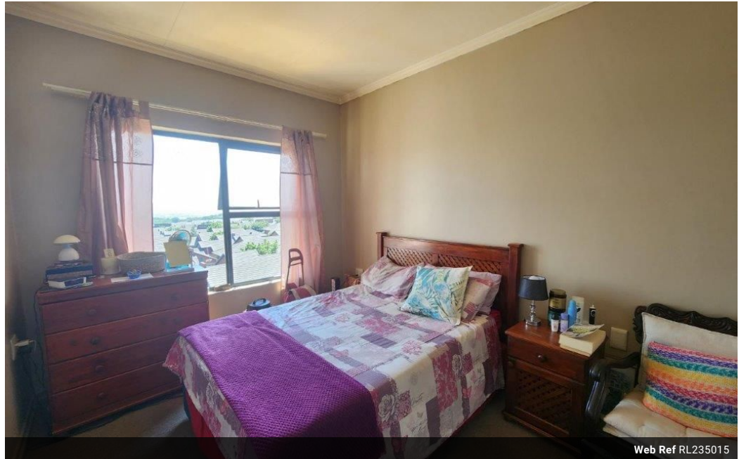
Web Ref RL235015

Third Floor Office Block F Hertford Office Park 90 Bekker Rd Vorna Valley Midrand