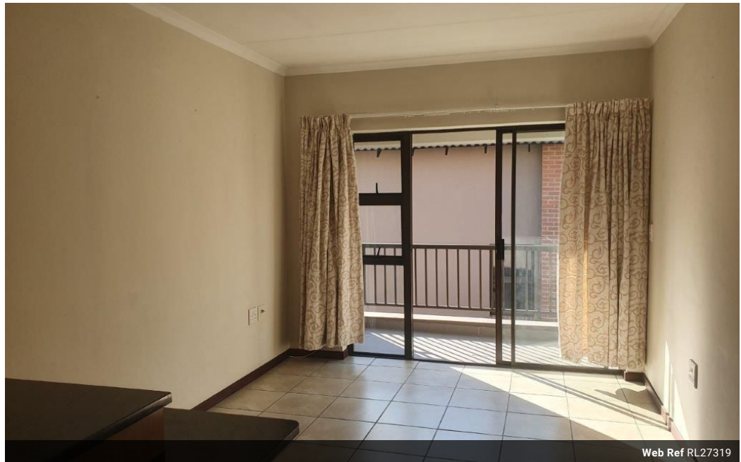
Web Ref RL27319

Third Floor Office Block F Hertford Office Park 90 Bekker Rd Vorna Valley Midrand