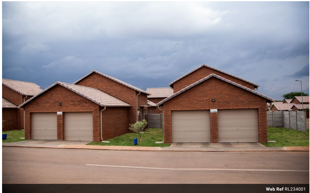
Web Ref RL234001

Third Floor Office Block F Hertford Office Park 90 Bekker Rd Vorna Valley Midrand