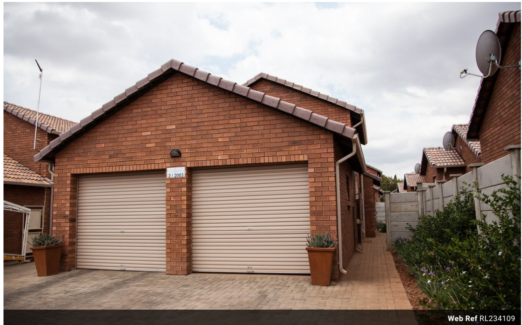
Web Ref RL234109

Third Floor Office Block F Hertford Office Park 90 Bekker Rd Vorna Valley Midrand