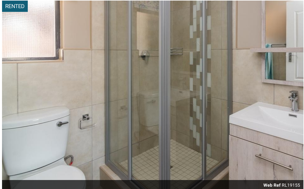
Web Ref RL19155

Third Floor Office Block F Hertford Office Park 90 Bekker Rd Vorna Valley Midrand