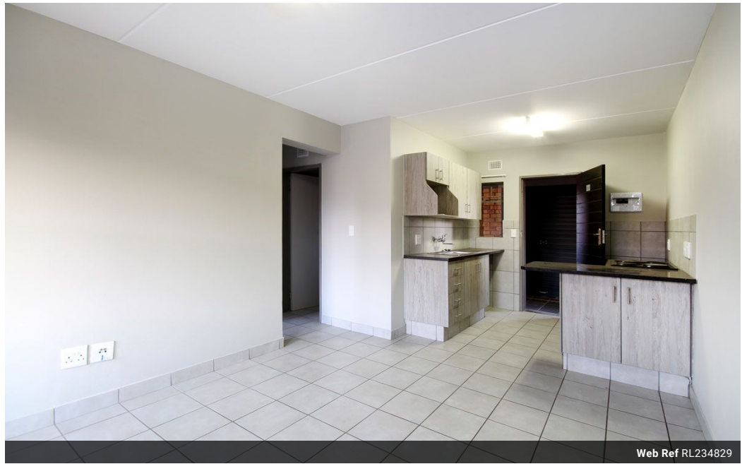
Web Ref RL234829

Third Floor Office Block F Hertford Office Park 90 Bekker Rd Vorna Valley Midrand