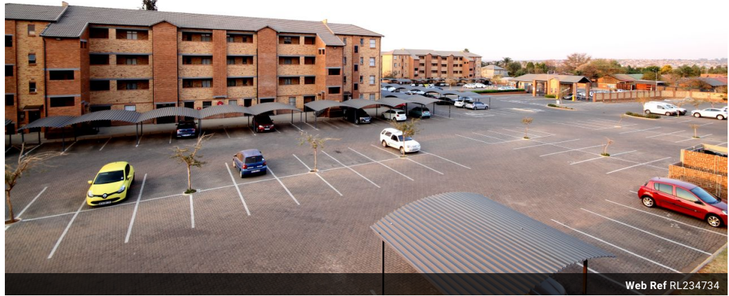
Web Ref RL234734

Third Floor Office Block F Hertford Office Park 90 Bekker Rd Vorna Valley Midrand