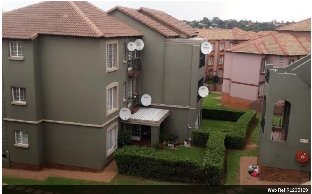
Web Ref RL235129

Third Floor Office Block F Hertford Office Park 90 Bekker Rd Vorna Valley Midrand