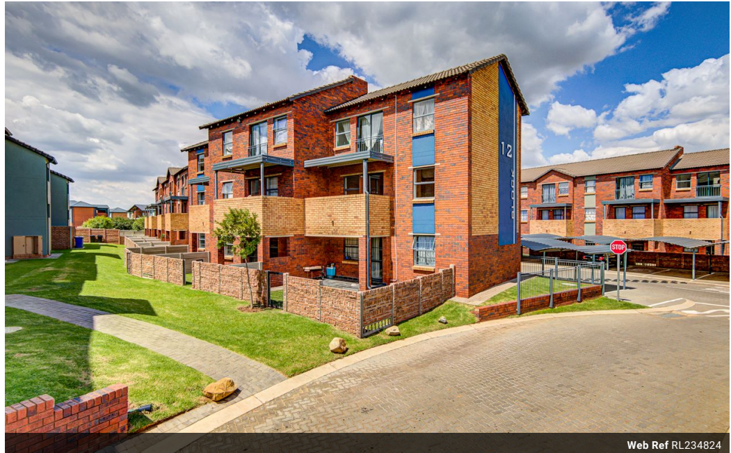
Web Ref RL234824

Third Floor Office Block F Hertford Office Park 90 Bekker Rd Vorna Valley Midrand