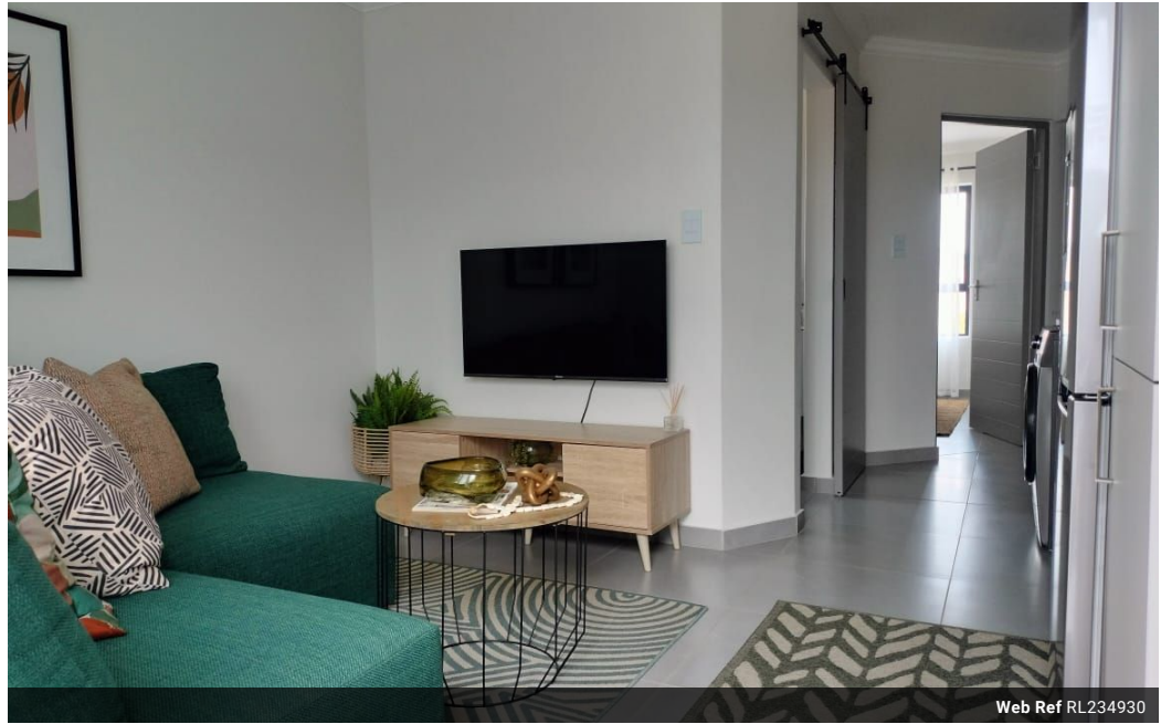
Web Ref RL234930

Third Floor Office Block F Hertford Office Park 90 Bekker Rd Vorna Valley Midrand