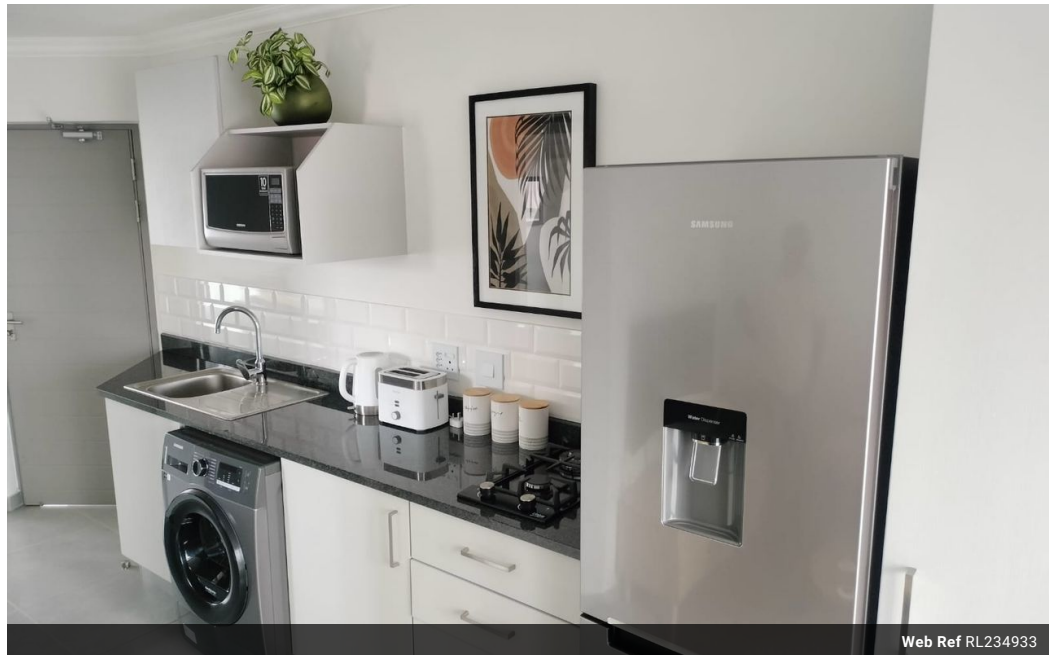
Web Ref RL234933

Third Floor Office Block F Hertford Office Park 90 Bekker Rd Vorna Valley Midrand