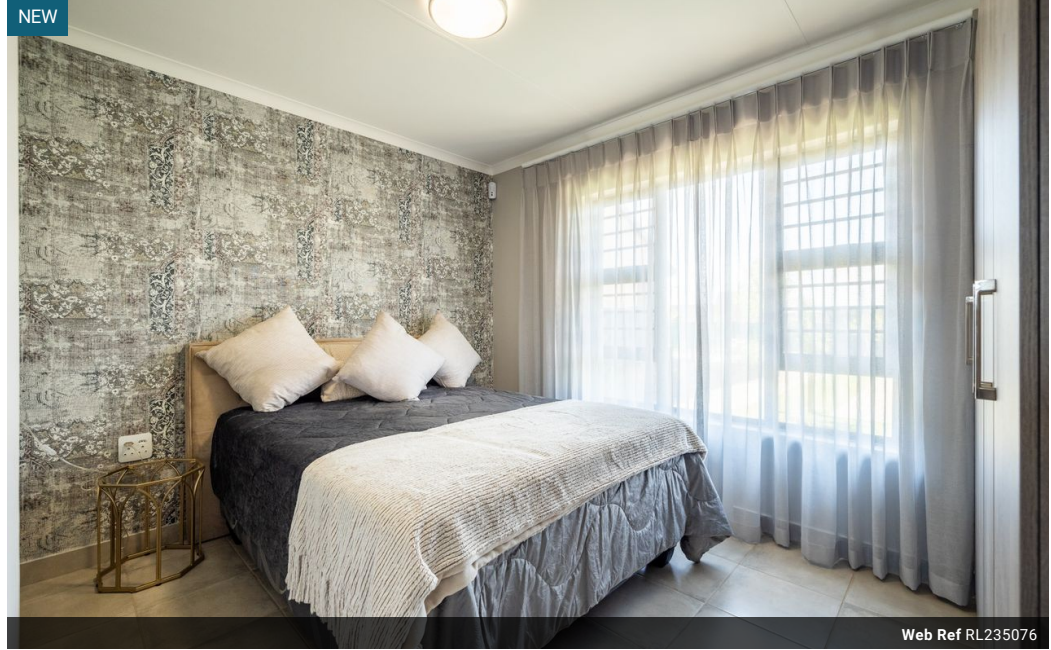
Web Ref RL235076

Third Floor Office Block F Hertford Office Park 90 Bekker Rd Vorna Valley Midrand