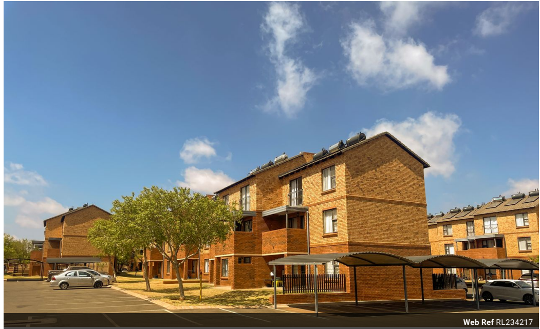
Web Ref RL234217

Third Floor Office Block F Hertford Office Park 90 Bekker Rd Vorna Valley Midrand