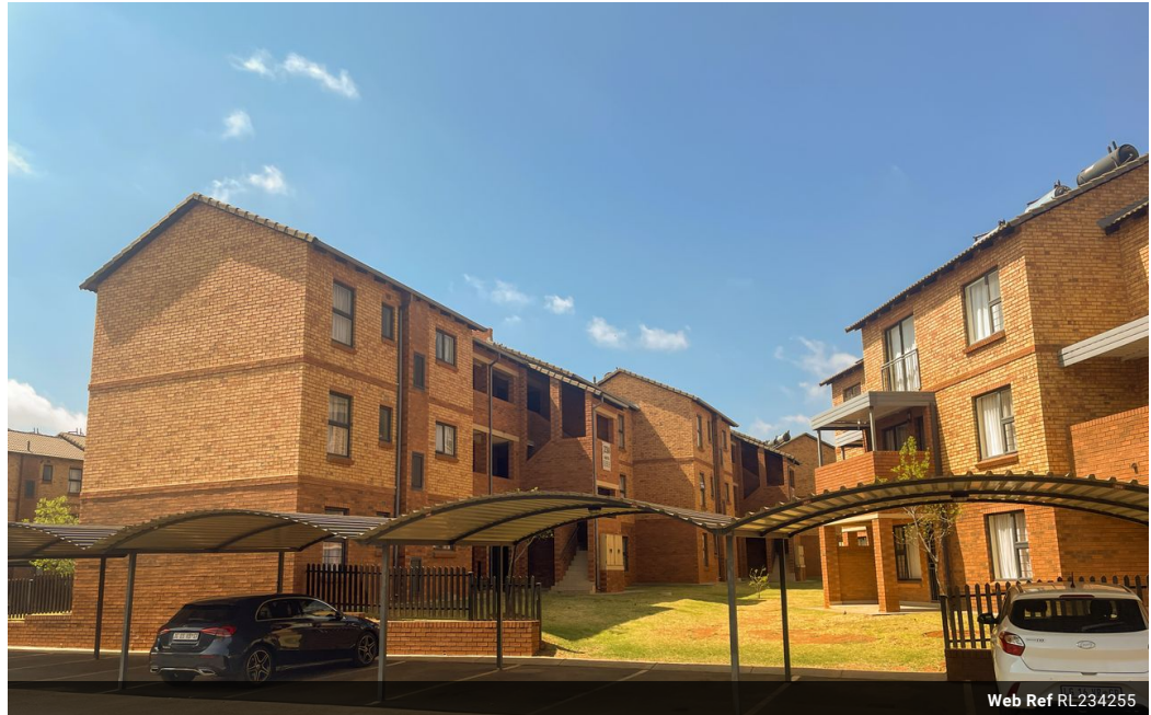
Web Ref RL234255

Third Floor Office Block F Hertford Office Park 90 Bekker Rd Vorna Valley Midrand