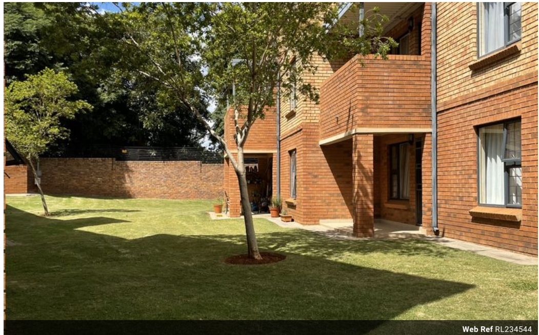
Web Ref RL234544

Third Floor Office Block F Hertford Office Park 90 Bekker Rd Vorna Valley Midrand