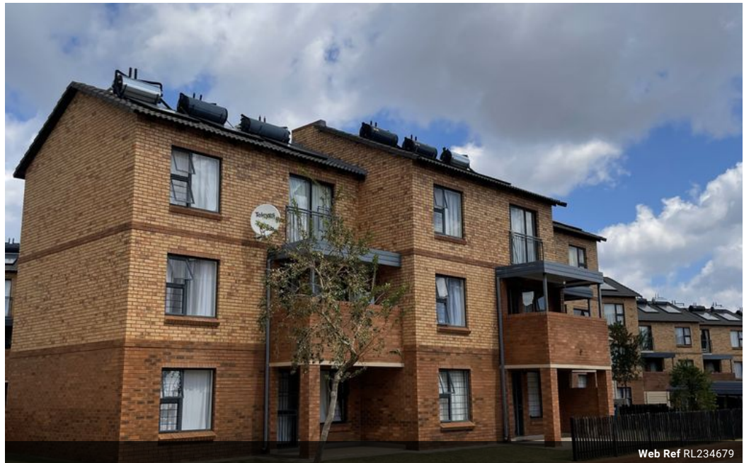
Web Ref RL234679

Third Floor Office Block F Hertford Office Park 90 Bekker Rd Vorna Valley Midrand