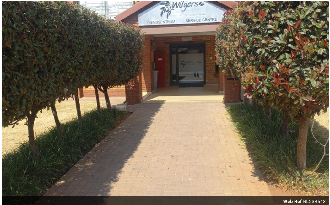
Web Ref RL234543

Third Floor Office Block F Hertford Office Park 90 Bekker Rd Vorna Valley Midrand