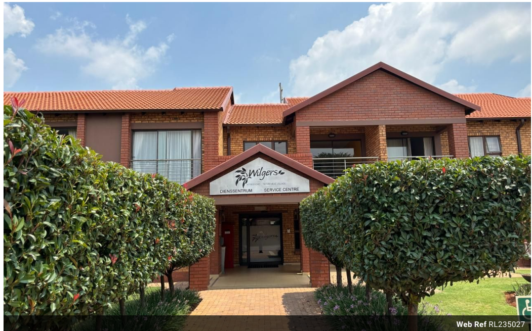
Web Ref RL235027

Third Floor Office Block F Hertford Office Park 90 Bekker Rd Vorna Valley Midrand